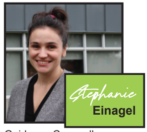
Guidance Counsellor, WICC/PEC