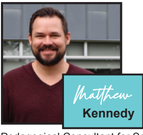
Pedagogical Consultant for Social Participation and Sociovocational Integration, Place Cartier Adult Centre/PACC Adult Centre